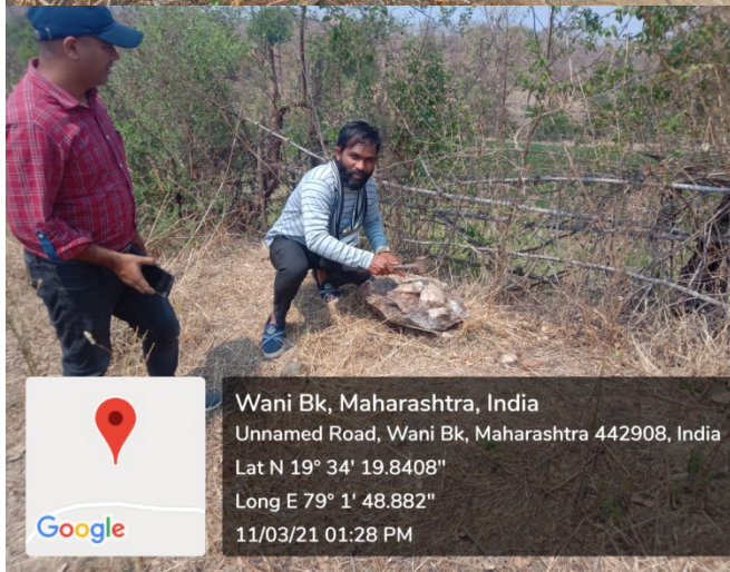
Wani Bk, Maharashtra, India Unnamed Road, Wani Bk, Maharashtra 442908, India Lat N 19° 34' 19.8408" Long E 79° 1' 48.882" 11/03/21 01:28 PM