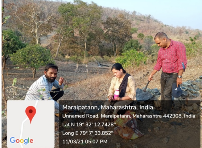
Maraipatann, Maharashtra, India Unnamed Road, Maraipatann, Maharashtra 442908, India Lat N 19° 32' 12.7428" Long E 79° 7' 33.852" 11/03/21 05:07 PM