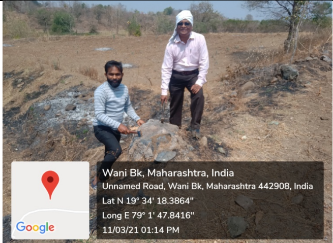
Wani Bk, Maharashtra, India Unnamed Road, Wani Bk, Maharashtra 442908, India Lat N 19° 34' 18.3864" Long E 79° 1' 47.8416" 11/03/21 01:14 PM