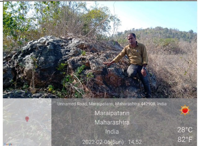
Research Students Visited to Jiwati Patan for Field Work