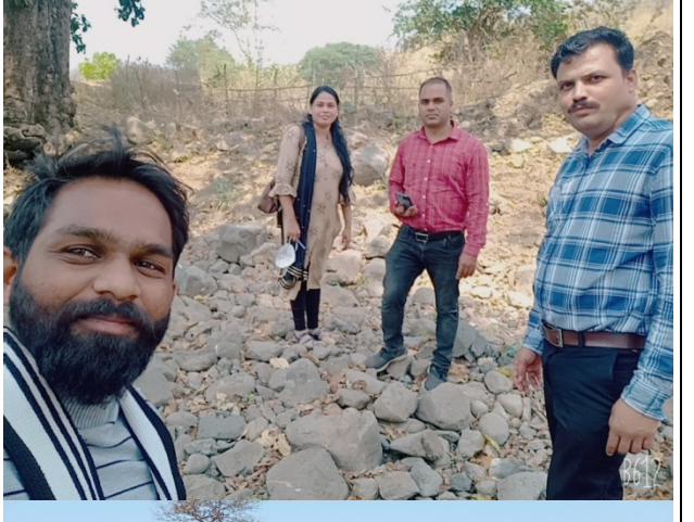
Maraipatann, Maharashtra, India Unnamed Road, Maraipatann, Maharashtra 442908, India Lat N 19° 32' 12.786" Long E 79° 7' 33.8376" 11/03/21 04:39 PM