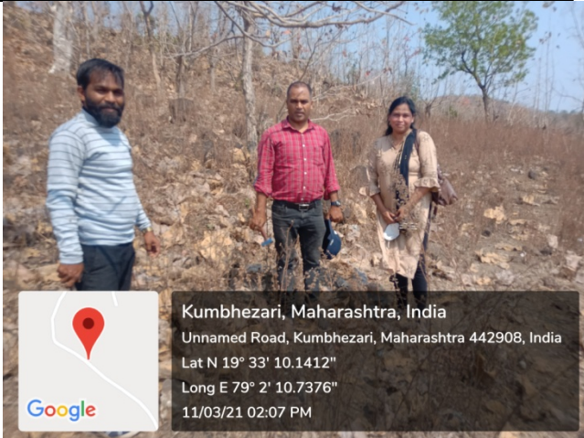
Kumbhezari, Maharashtra, India Unnamed Road, Kumbhezari, Maharashtra 442908, India Lat N 19° 33' 10.1412" Long E 79° 2' 10.7376" 11/03/21 02:07 PM