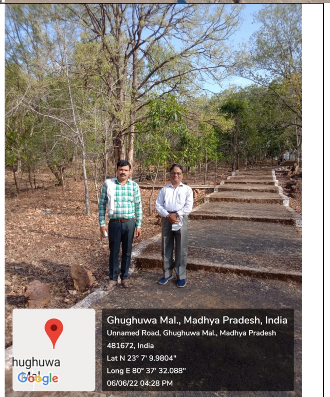
Research Students Visited to Ghughuwa M. P. for Field Work